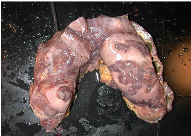
Figure 1. The fibrotic wall of encapsulated bowel segment